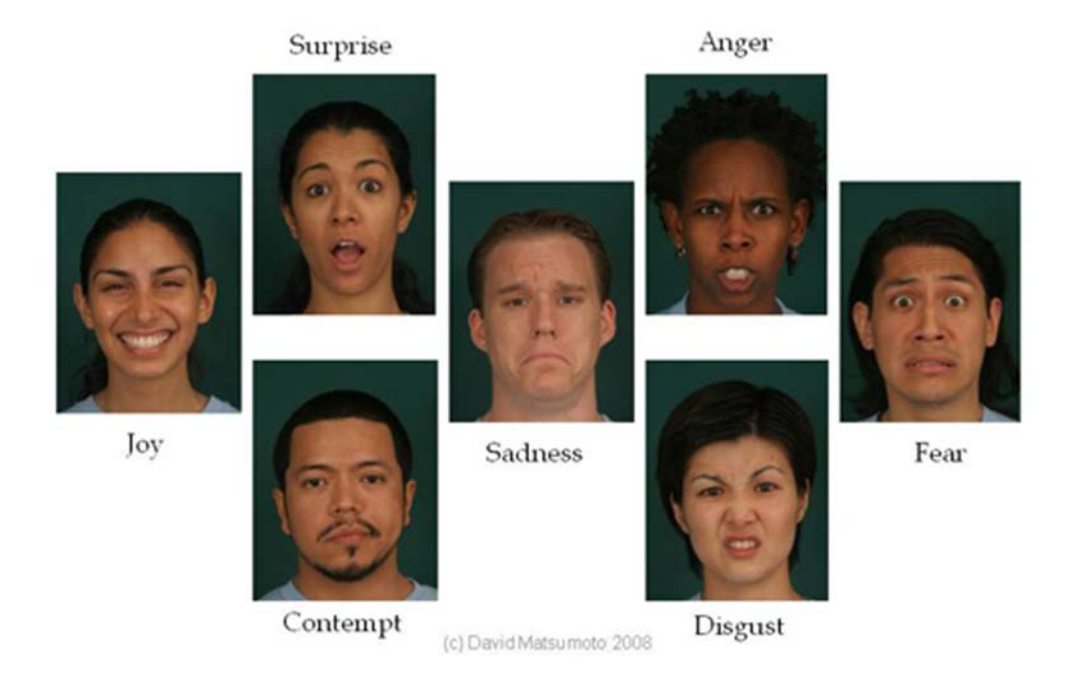
Figure 1: The 7 Biologically Innate Emotions, and Their Facial Expression